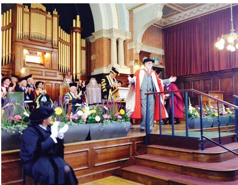
Vint Cerf UoR Great Hall Honorary Doctorate Event 9 July 2015

Thirty-five questionnaires were returned, either in hardcopy or electronically: 55% were boys and 45% were girls; ages ranged from 8 to 14