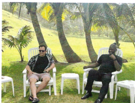
Family Foundation with sponsorship mainly from The Maria Holder Memorial Trust with some financial support from lots of benefactors from the UK and Barbados.