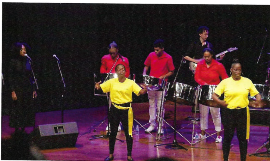
Calypso 2022 brought together deaf and hearing musicians, artists, filmmakers, and writers from across the UK, USA and Barbados. Music

It is society – not deafness – that disables, and Calypso 2022 raised awareness of this across the community, inspiring a new generation of deaf Barbadians